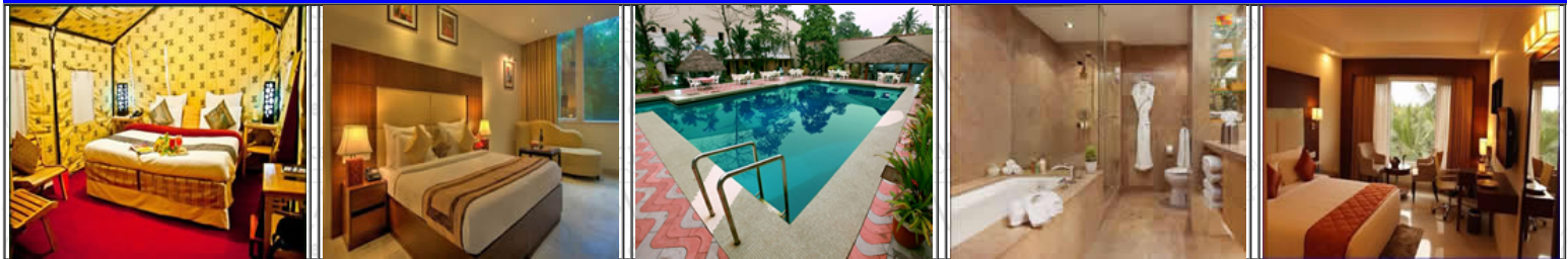
Deluxe AC Tent